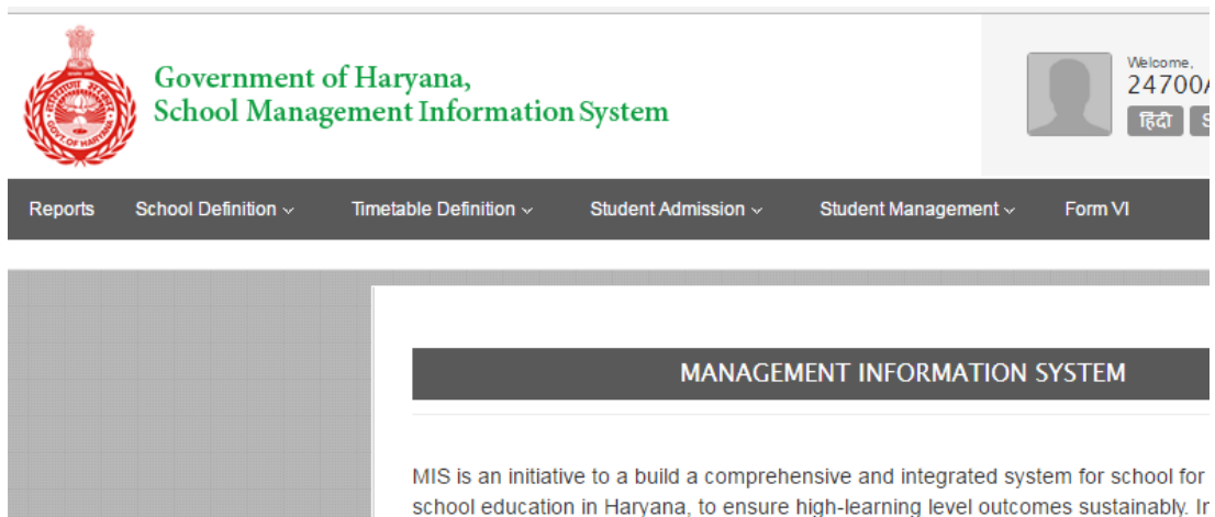
Figure 1 Home page of School login